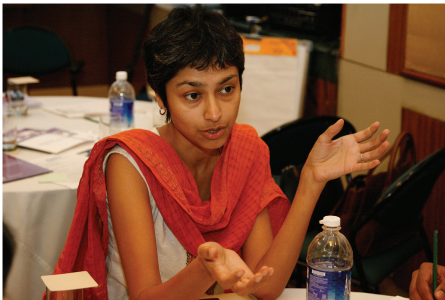
Workshop participant in India

b. http://news.bbc.co.uk/2/hi/business/8048488.stm