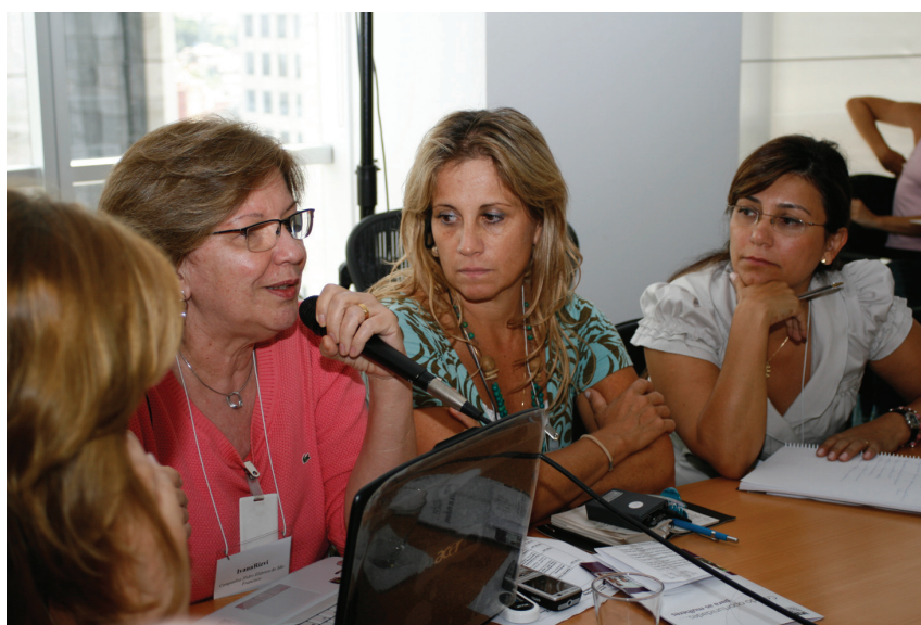
Workshop participants in Brazil

Note: The disaggregation on the basis of gender and race relate to South Africa's black economic empowerment legislation.