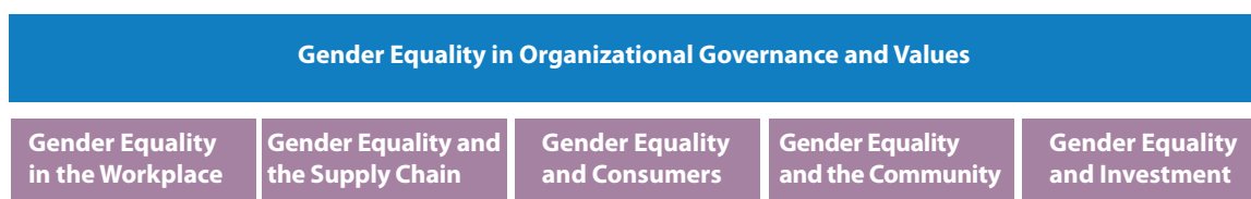
Figure 1.1 Aspects of Gender Equality.

Organizations are faced with a wide range of gender-related issues on which they could report. Report preparers at the workshops stressed that they cannot report on everything and therefore it is necessary for organizations to prioritize internally and consult stakeholders as to what should be included in their reports, as well as reference the gender clauses contained within national, regional and international legislation. During the connection and definition phases of the reporting cycle, reporters determine which gender-related issues are most relevant to their organizations.